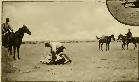
TIEING A MEAN ONE.